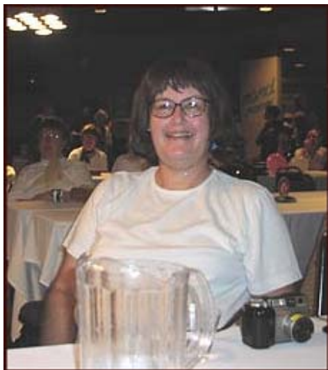
Anybody know who this is? HINT: We'll be seeing a lot of her next year.